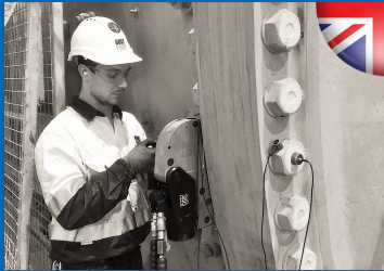
LAPP Equipment UK City & Guilds Flange Management Joint Integrity (FMJIT) for the Assembly, Tightening and Disassembly of Bolted Connections. **With associated Knowledge for JIT10, JIT18 & JIT19 ** Contact LAPP Equipment UK to take this course >>> enquiries@lappuk.co.uk